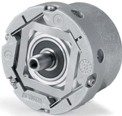
ECN/ERN 1300 and ECN/ERN 400 series

Rotary encoders from HEIDENHAIN are characterized by excellent signal quality and high accuracy, and are therefore a guarantee for high-quality velocity control and exact positioning.