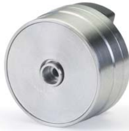
ECI/EQI 1100 series