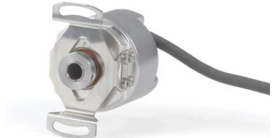
ERN 1000 series