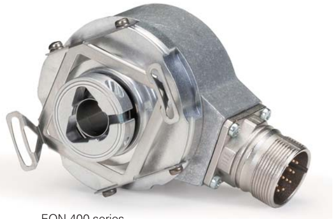
EQN 400 series