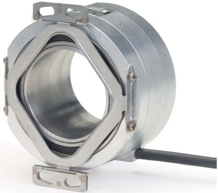
ECN/ERN 100 series