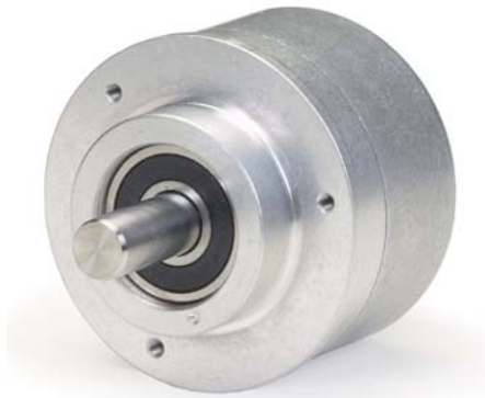
ROQ 400 series (clamping flange)